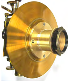
Zeiss quick connect coupler attached (black)