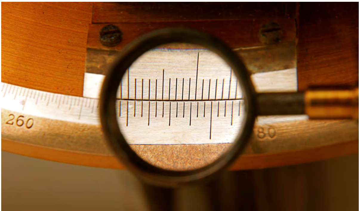
FRA20: Gustav Heyde, Dresden, Multi-Wire Filar Micrometer.