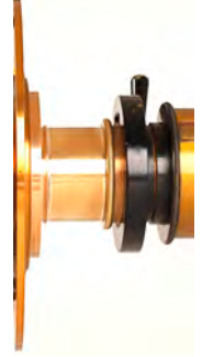
Micrometer attached to telescope focus tube