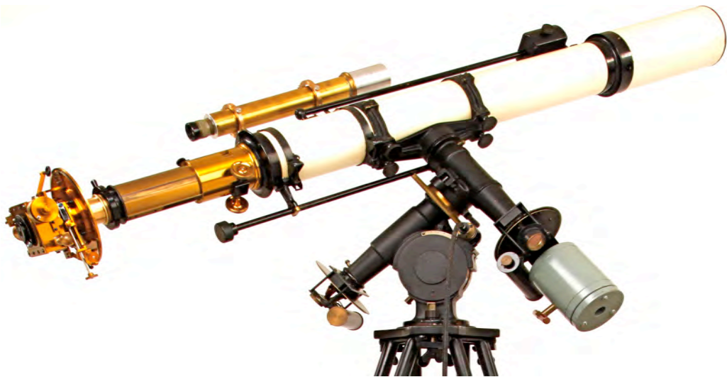
Gustav Heyde Multi-wire Micrometer mounted on Zeiss telescope