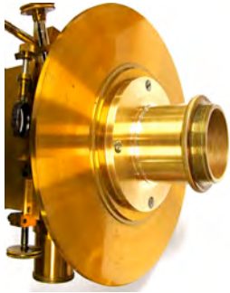
Threaded Zeiss tube sized and soldered to Heyde micrometer mounting plate

Result: Impressive Heyde micrometer fitted to an equally impressive Zeiss - no change to telescope; the brass coupler flange on micrometer was modified from some unknown telescope to accept the Zeiss quick-connect coupler.