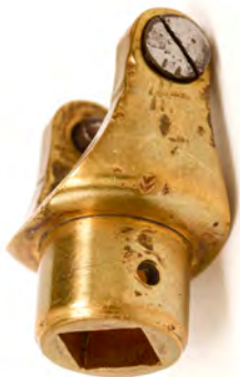
Original brass 1/2 swivel