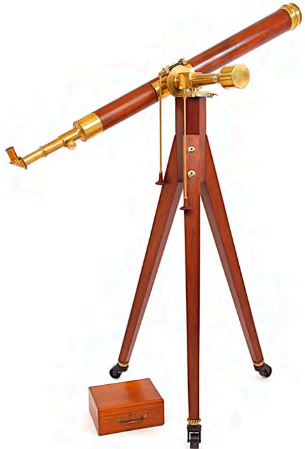
After Restoration and Repair