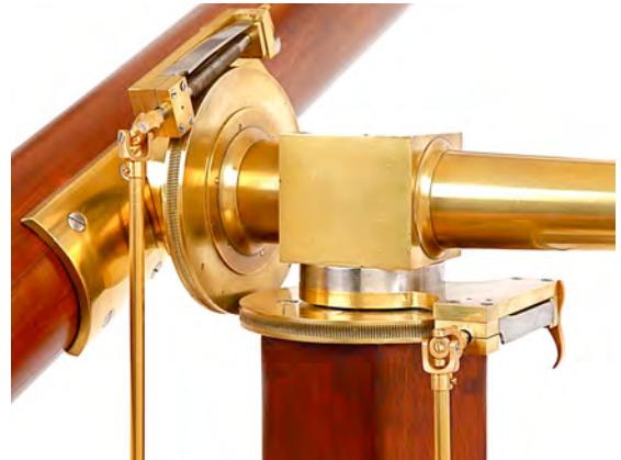
After: Beautiful original wood revealed (walnut tube and mahogany tripod) and new restored brass control rods. New control rods designed from remaining original swivel (below) and photos of same period Merz - fabricated from mahogany and brass.