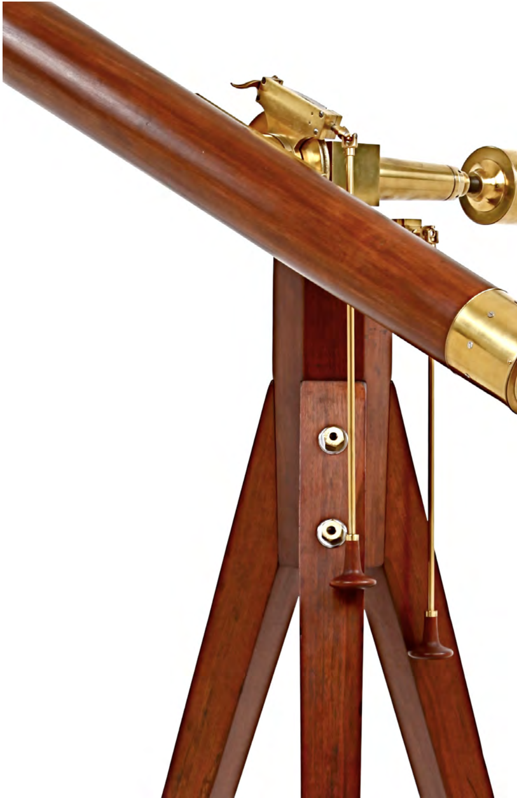
FRA28 Beautiful walnut tube and mahogany tripod beneath the black antique paint!