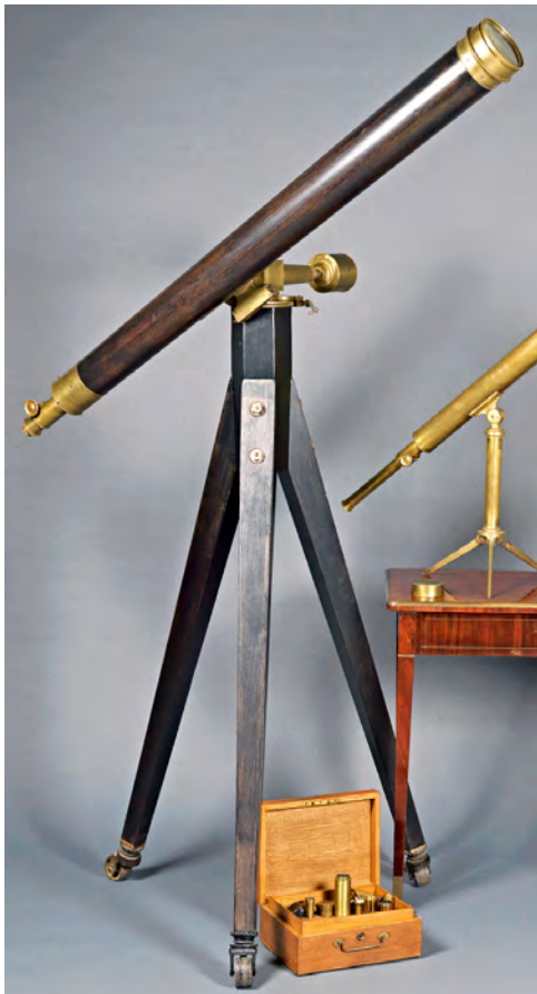
Before Restoration: Black paint, broken/missing adjusters and lenses lying loose in an oak case

Dorotheum Vienna, auction catalogue 20 October 2006.