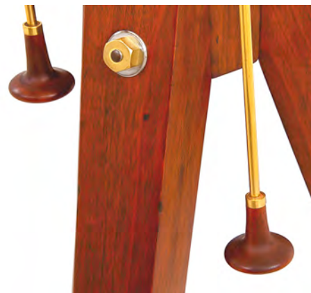
After: Restored/new brass swivels, brass control rods and knobs.