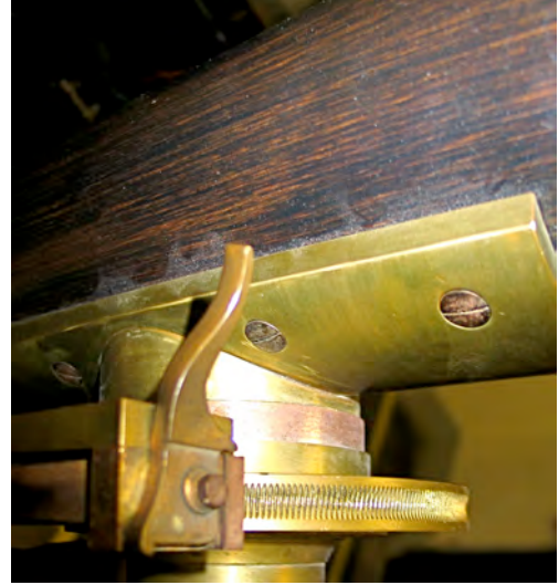
Before: Black paint, rust, broken and missing control rods