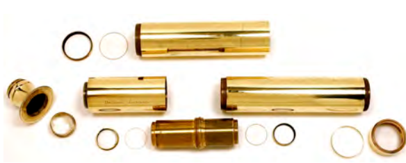
12-ft Dollond: 5-lens and 6-tube assembly (One tube is missing; a retrofit end-cap holds lens #1)