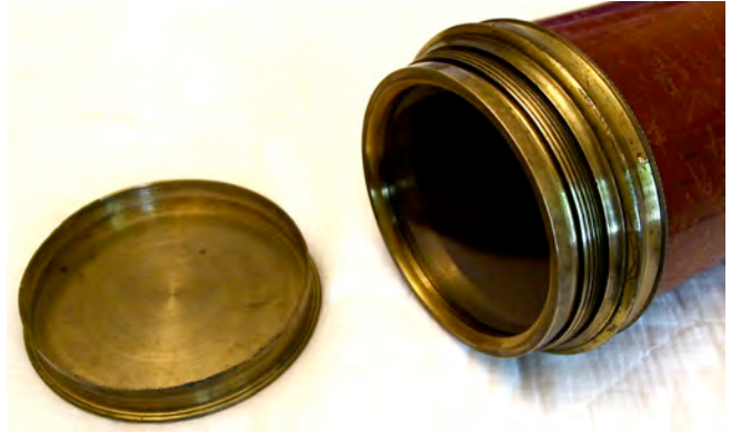
Screw-on brass end cap configuration