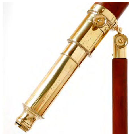
Rack-and-pinion fine focus superimposed on a drawtube focus. Note also original hardware (upper right) for attaching a stabilizer staff as shown