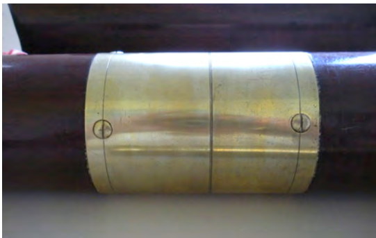
Brass coupler for upper/lower sections No mounting bolts on telescope