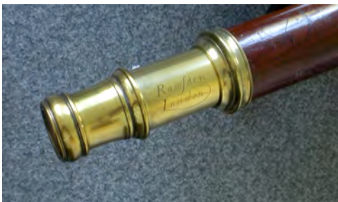
Focuses as a spyglass