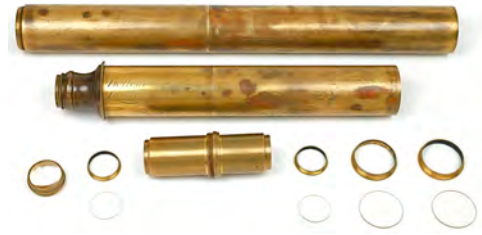
8-ft Dollond: 5-lens 6-tube eyepiece assembly (complete)

Eyepiece comparison includes an 8-ft. Dollond, FRA25 from the Wolf Collection. The two Dollond eyepieces are nearly identical; an in-depth comparison with the Ramsden may prove its similarity as well.