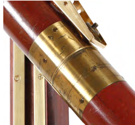
Telescope tethered to pole showing coupler and one of three mounting bolts; all three bolts have Dollond knurled nut fasteners