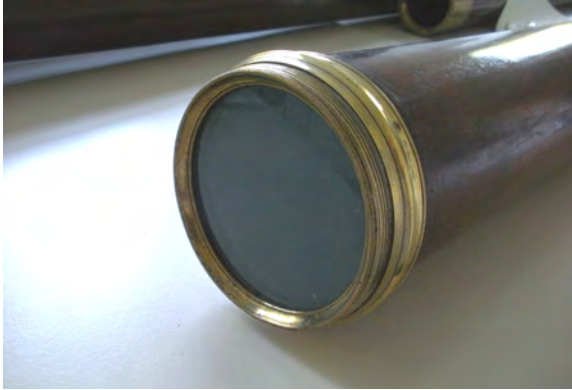
Screw-on brass end cap configuration