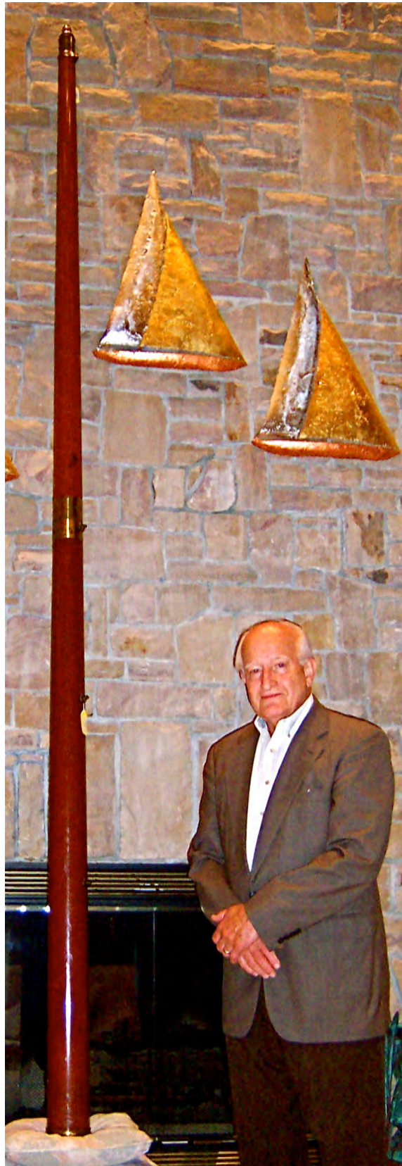
FRA29 12-ft. Long Dollond Telescope, c. 1761-66