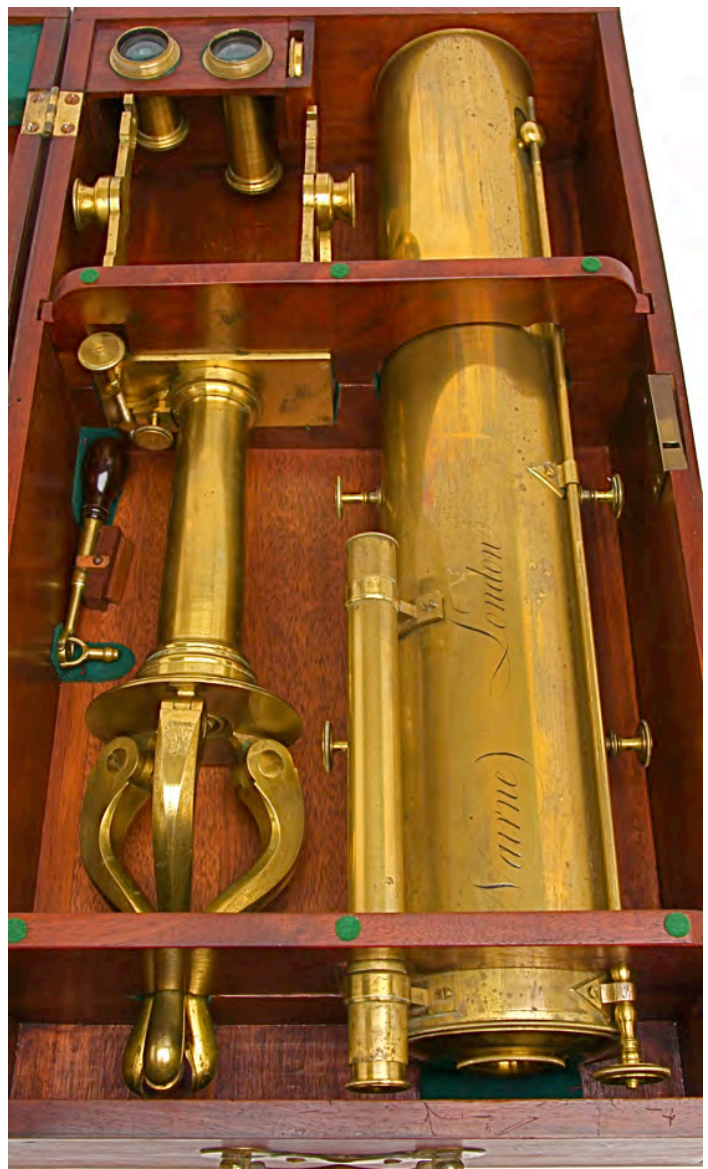
After cleaning and installation of accessories