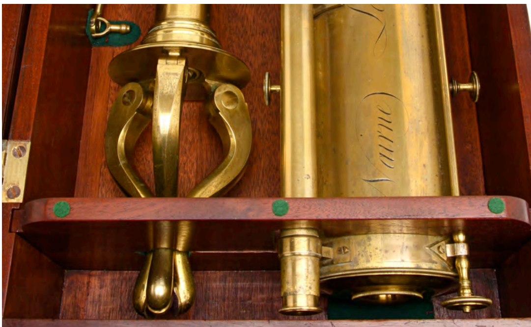
After cleaning: Both telescope and storage case refreshed with corrosion halted - no effect on originality excepted for mounted slow-motion adjustor in far upper left corner of photo directly above.