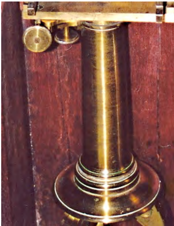
As received in need of cleaning and space available for slow-motion adjuster