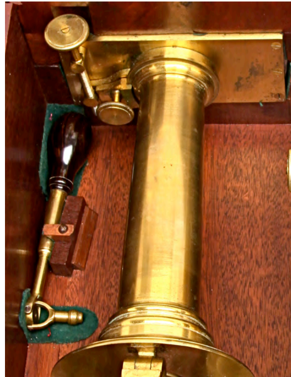
Adjuster securely mounted and out of the way