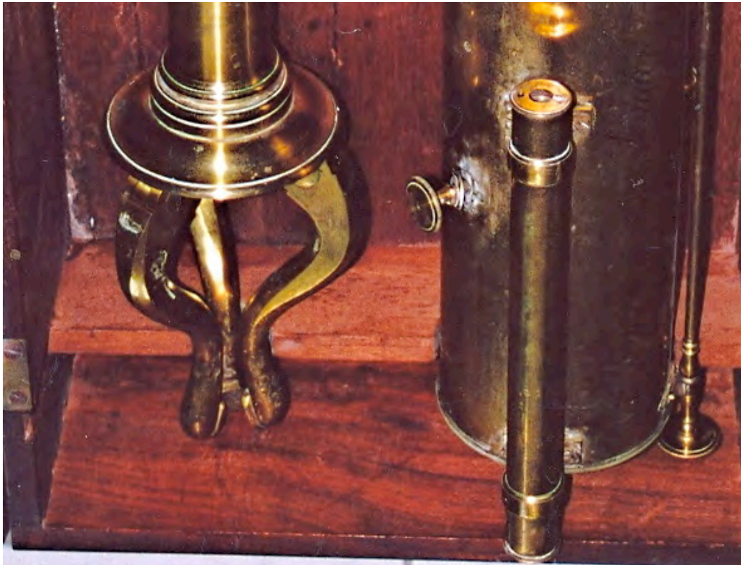
As received: Telescope badly corroded; storage case dirty with residue and stain and water marks.