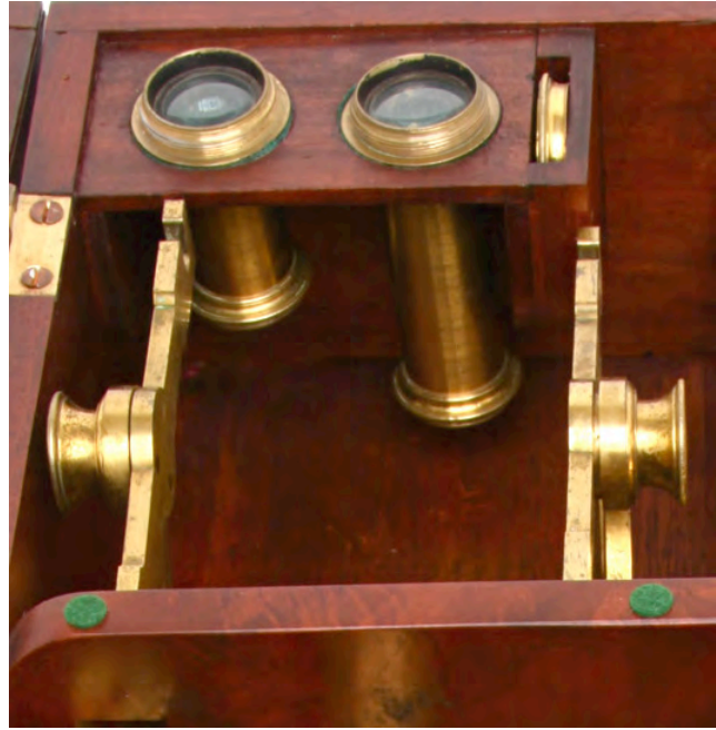
Newly fabricated eyepiece cover plate holder located over position of old vertical support board.