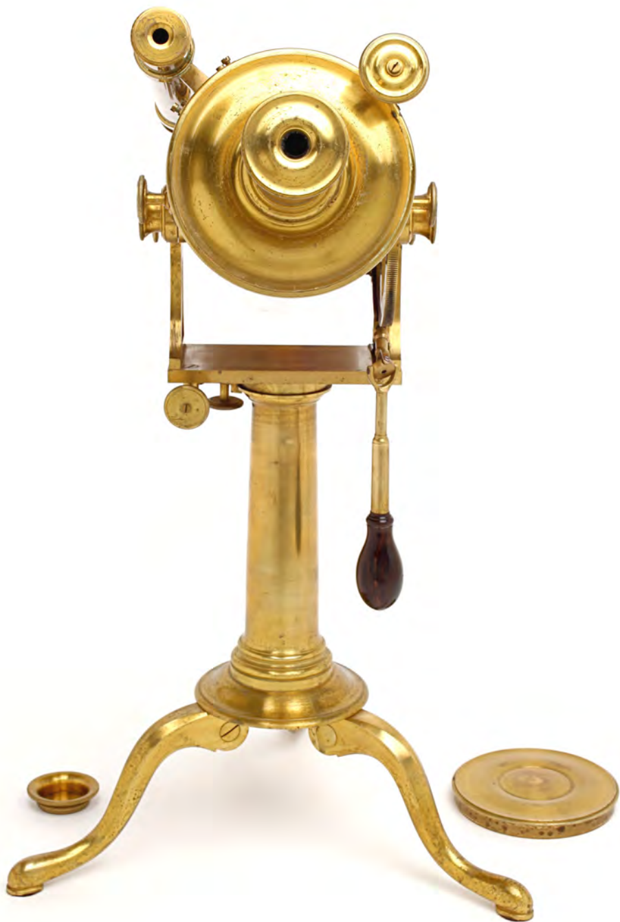
TRE8 10-mm Naime Reflecting Telescope with slow-motion control, c. 1760?