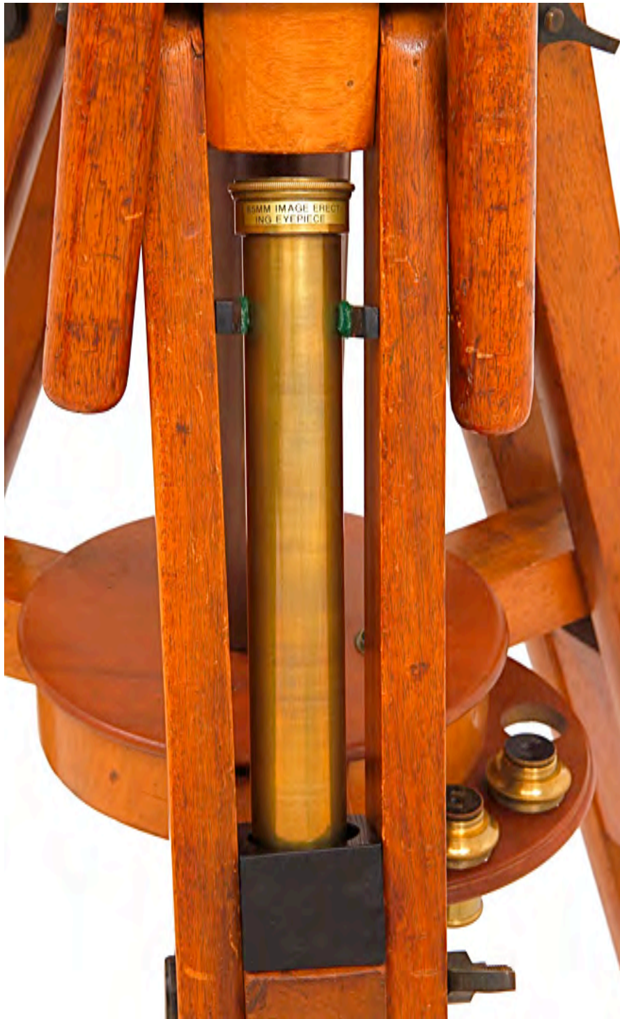
The terrestrial eyepiece tube holder shown here in black (center top and bottom) is held in place by pressure from the tripod legs as the top and bottom tripod bolts are tightened. The components of the two-piece eyepiece tube holder were made just slightly wider than the space between the tripod legs. No bolts, screws or holes - just a friction/compression tight fit!