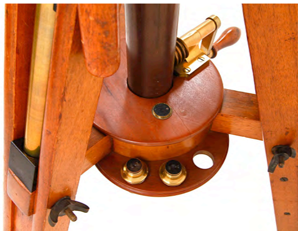
The damaged and incomplete original top plate now shown in place after holes were cut with a Forstner bit and the plate attached to the bottom of the central block with wood screws from below. Note the black Velcro button just above the eyepieces for holding the star diagonal.